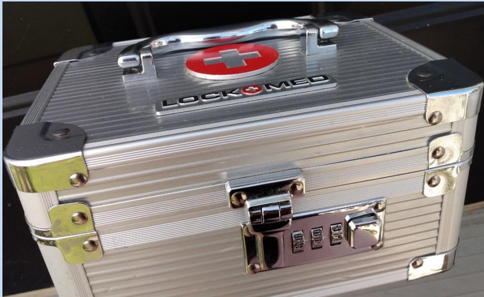
Example of a locking medication box